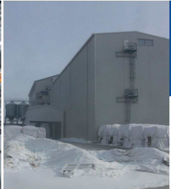
Turnkey Seed Plants