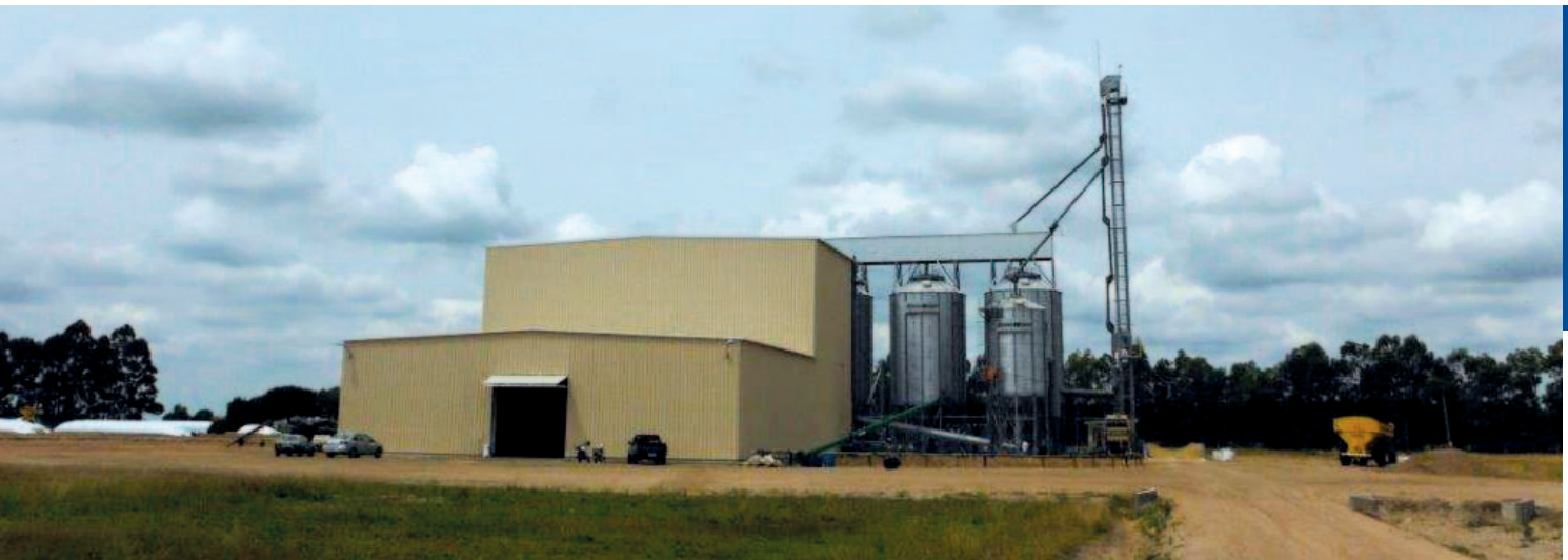
Turnkey Processing Lines